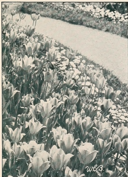
Bed of Cottage Tulips

F. F. Rockwell's book of Bulbs is the completest exponent on bulb culture, giving accurate description of varieties, culture, and making its 264 pages well worth the price, $3.00.